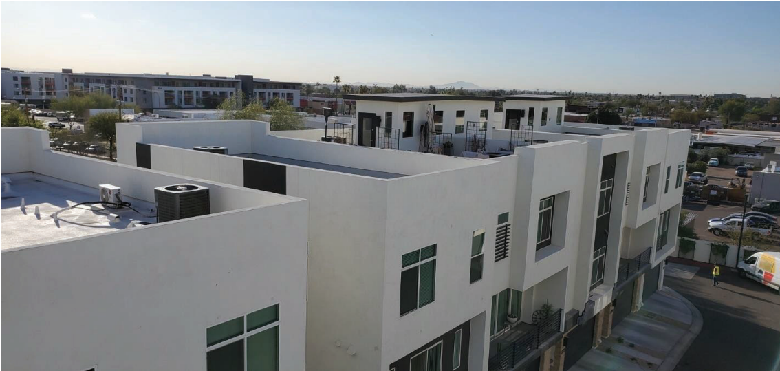
View of rooflines of typical buildings.