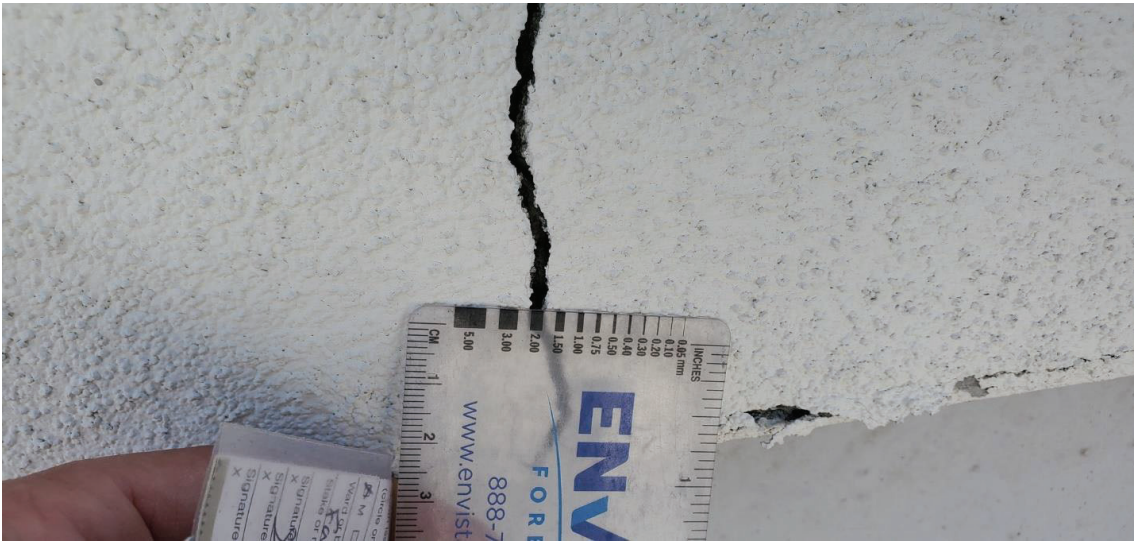
Typical view of crack in stucco.