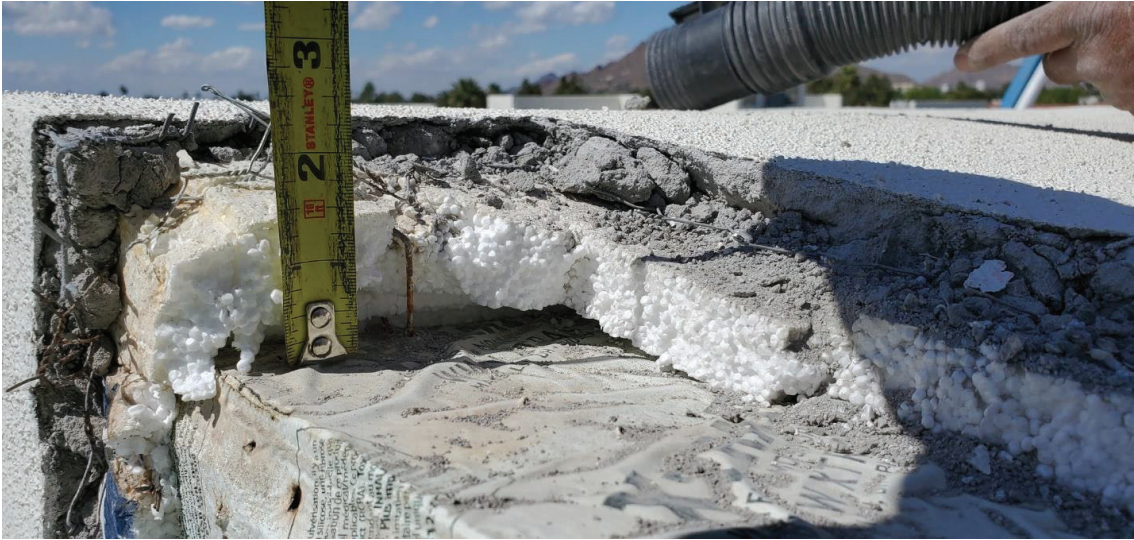
Typical view of destructive investigation work through the stucco cladding and foam insulation at roof parapet.