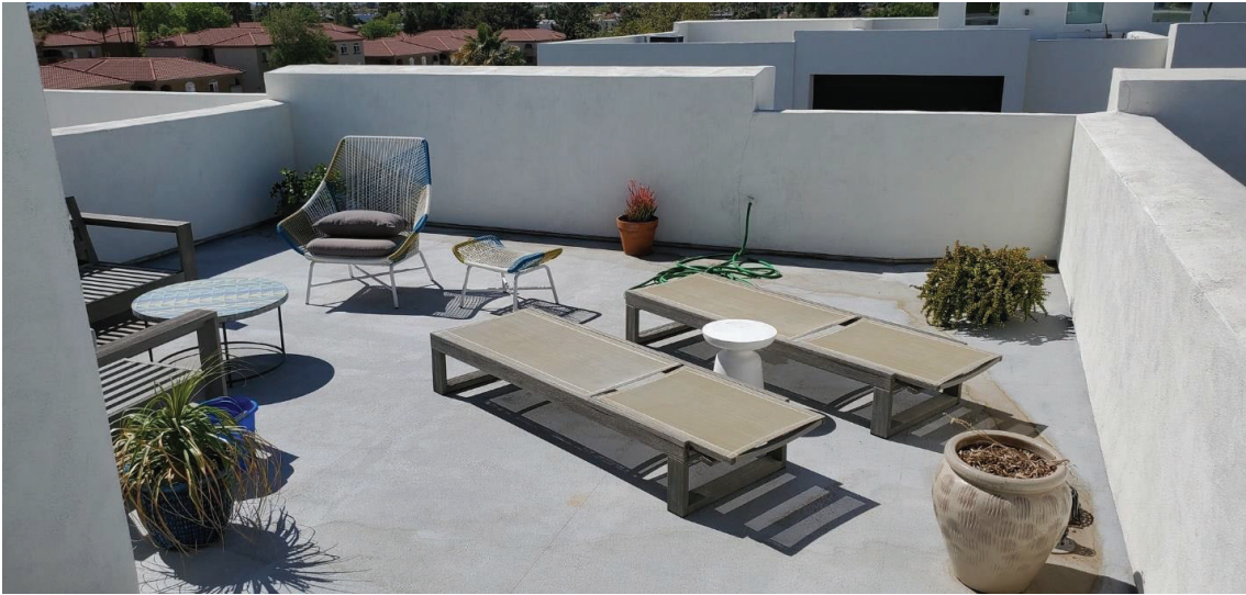
View of typical roof condition and slope.