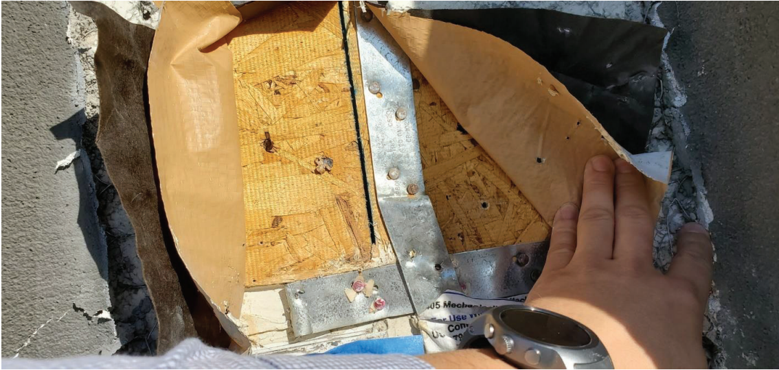
View of exterior wood panels and metal straps behind deconstructed stucco cladding and building paper.