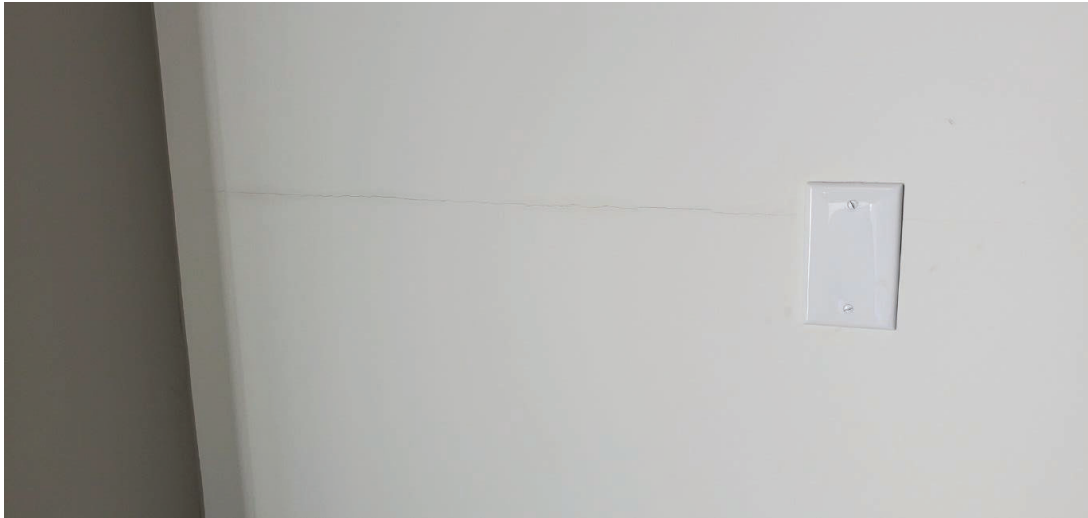
View of ceiling stain and crack below general location of tear in roofing depicted in previous photograph.