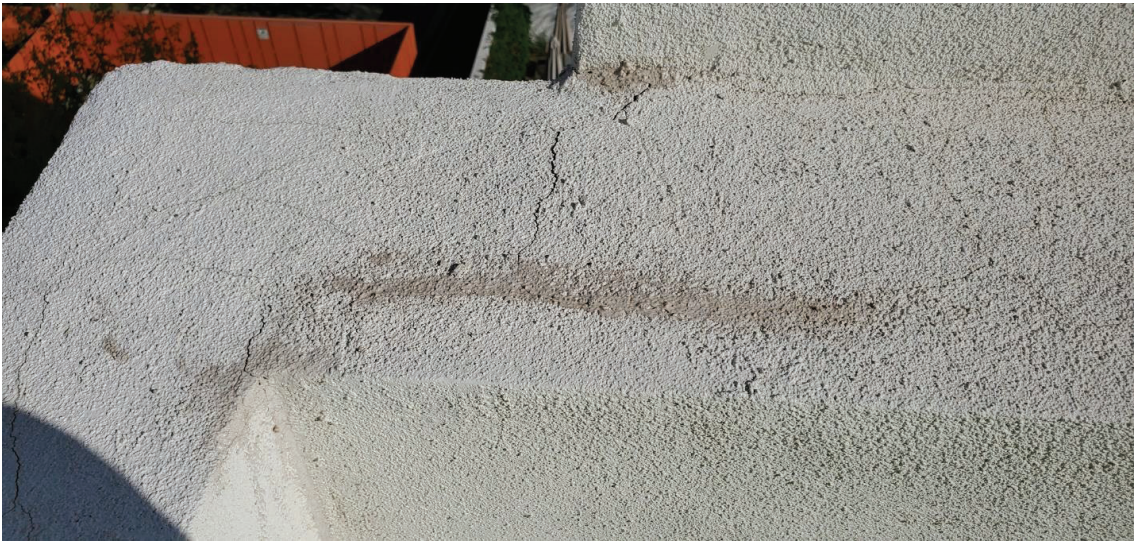
Typical view of cracks in stucco.