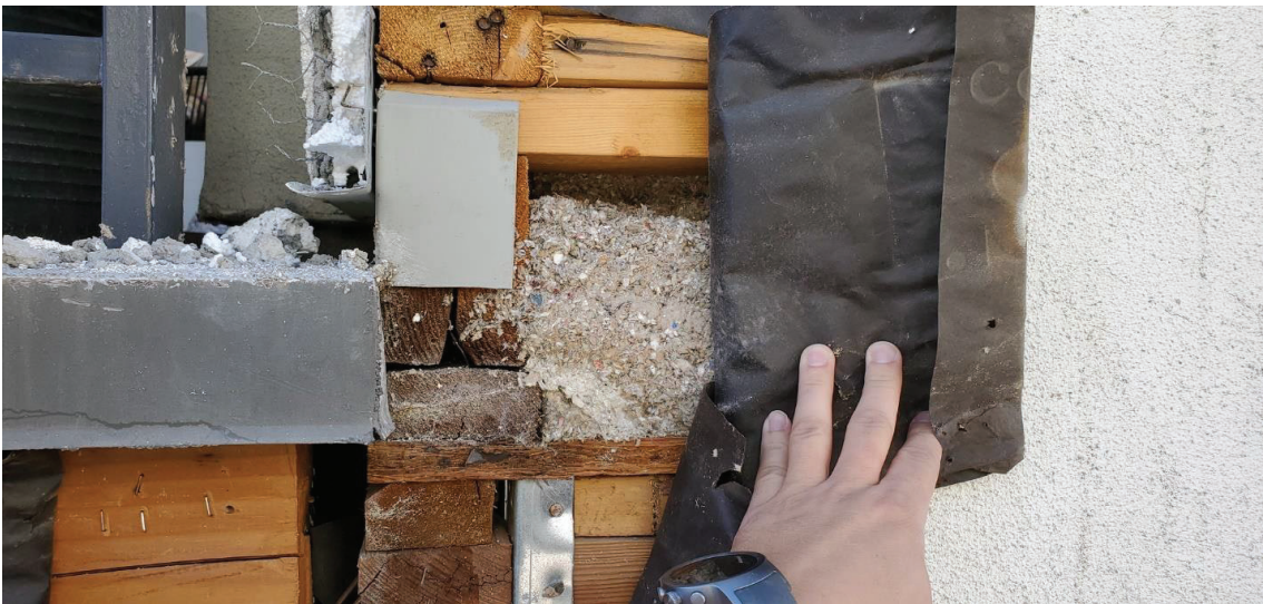
View of typical wood framing near balcony.