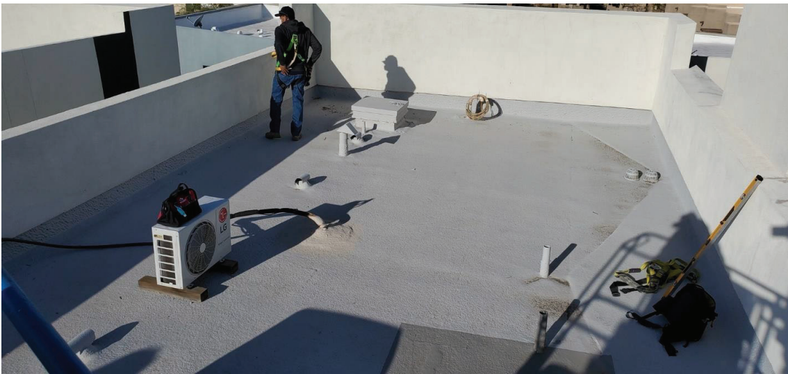
View of typical roof condition and slope.