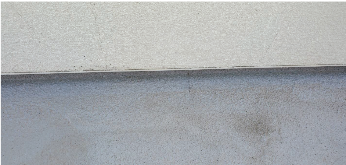
View of crack/tear in roof surface.