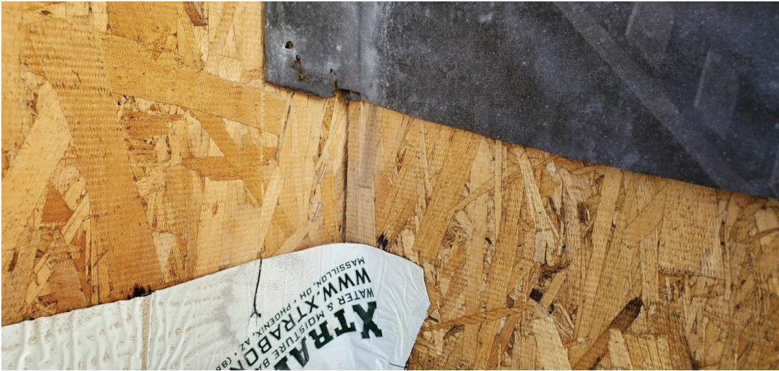
View of exterior wood panels behind deconstructed stucco cladding and building paper.