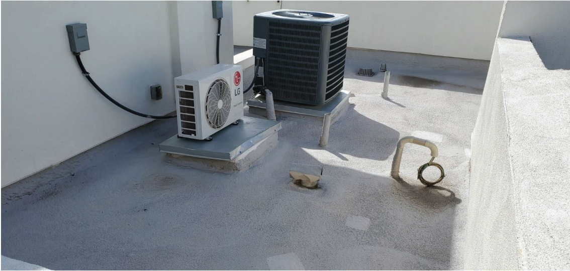
View of typical roof condition and slope.