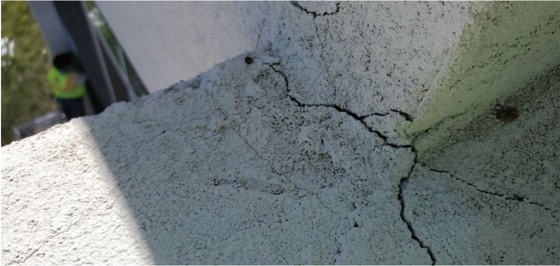
Typical view of cracks in stucco.