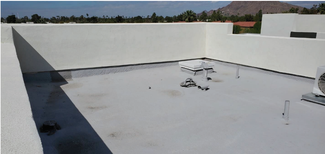
View of typical roof condition and slope.