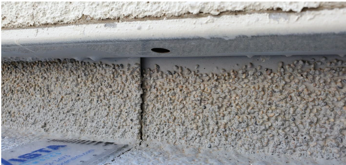
View of flashing termination at location of tear in roof depicted in previous photograph.